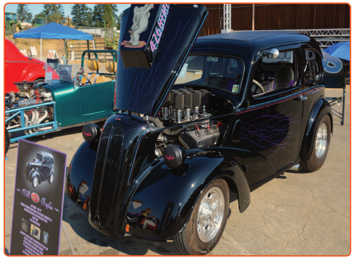
There were several 1960s style gassers on display at this show, including this cherry street driven Anglia. Powered by a Hilborn injected 426 Hemi, it looked ready to run heads up against its arch rival, a wicked Willys.