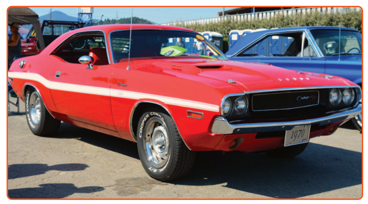
This 1970 Challenger R/T won the Mr. Norm's Award at the show. Nice, extremely original E-Body was red inside and out. It packed a stock big block and even featured a set of optional factory rear window louvers which were all the rage in 1970.