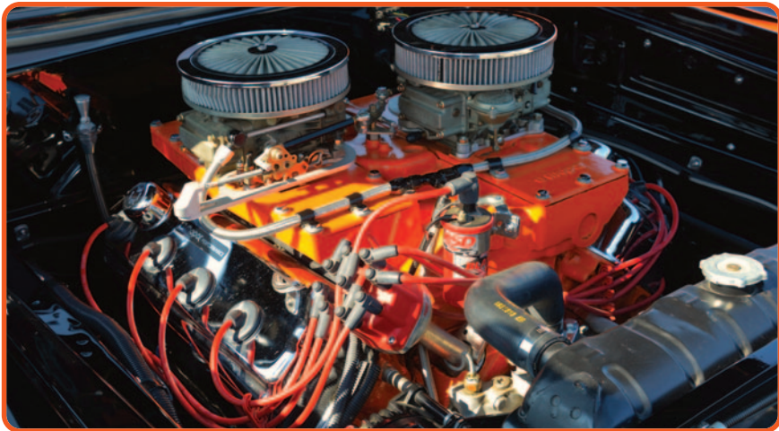
Intimidating 1964 Dodge 330 sedan was not only straight enough for black, but was powered by a 426 Hemi with dual quads on a cross ram. A great example of the kind of Super Stock Dodge that you could actually purchase new from your dealer in 1964.

celebrated announcer who called out NHRA championship drag racing action for decades. Dan spent the day walking the length and breadth of the show, interviewing enthusiastic participants about their vehicles. After a full day on the show field, Dan closed out the event in style, announcing each of the winners as the awards were presented on the Midway of the fairgrounds.