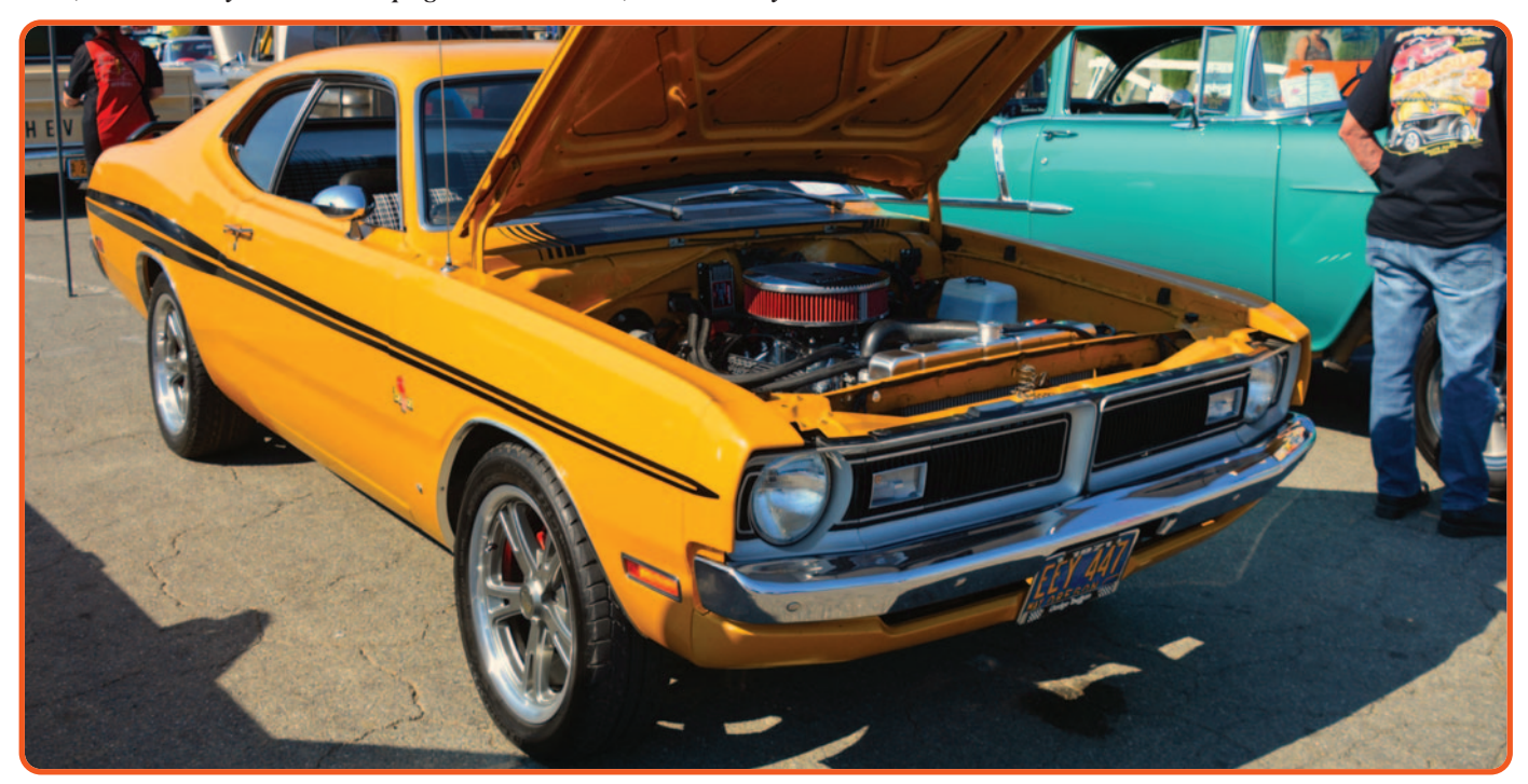
1971 Demon 340 was hard to miss with its bright yellow paint. The neat A-Body sported a wide range of upgrades from engine performance mods to trick custom wheels.