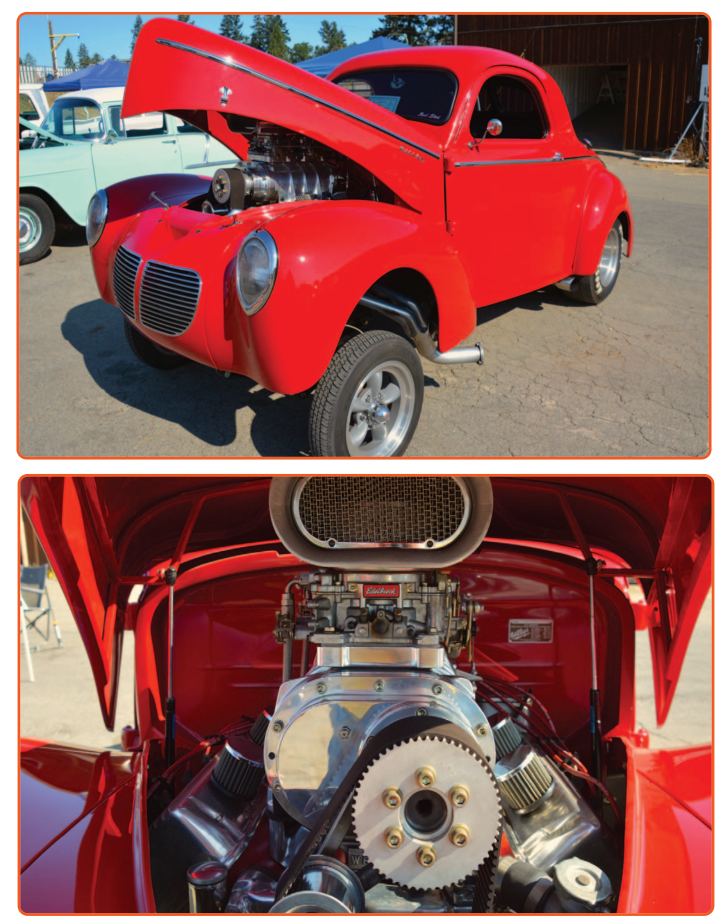
Speaking of wicked Willys, this blown 392 Hemi powered 1940 Willys Americar was a great example of the breed. With a giant size Elephant lurking under the hood, it made a statement that was anything but subtle.