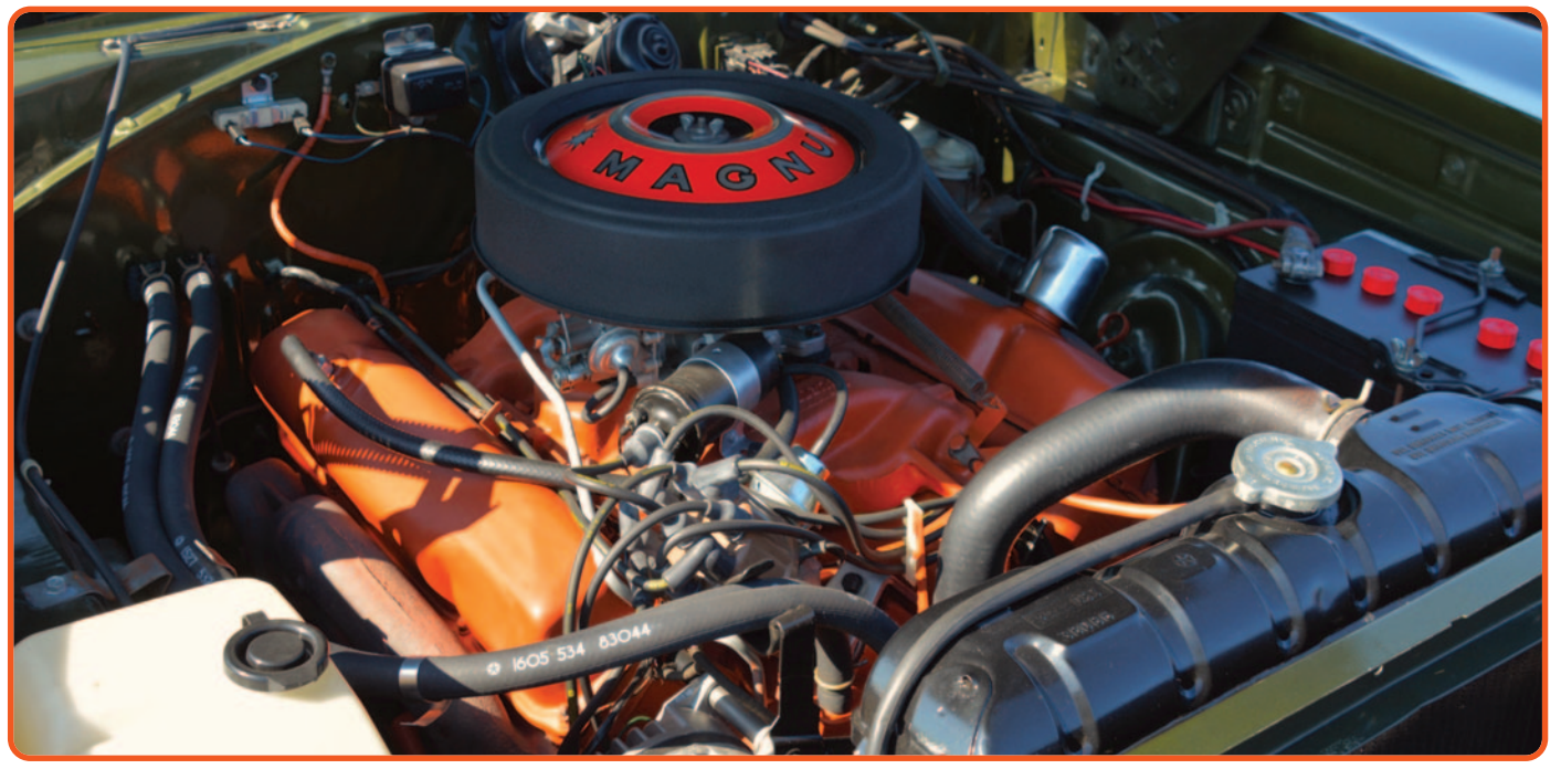
Talk about factory fresh, this 1969 Dodge Charger R/T was a 16,653-mile unrestored original. Even the engine looks like it just rolled off the assembly line. Imagine a time not so long ago when Chargers much like this one were a common sight. Today, a survivor of this caliber is the epitome of rarified air.