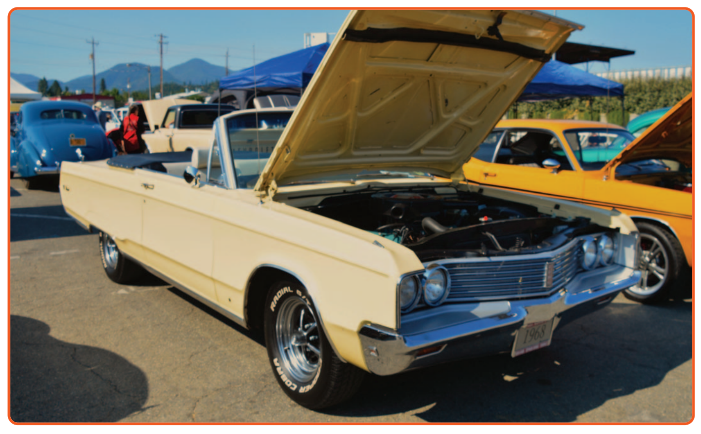
Another C-Body convertible, this one's a rare 1968 Chrysler Newport. If you think it's nothing more than the perfect ride to cruise the strand then get ready for a big surprise. Under the massive hood is a built 440 that's backed up with a beefed up 727 Torqueflite. Big and fast, the best of both worlds