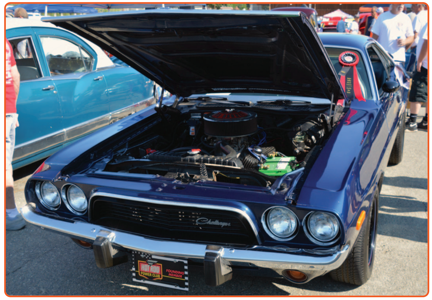
Unlike the '70 Challenger, this early E-Body was highly modified and looked like it was ready to race. Deep blue paint and rolling stock that consisted of matching painted wheels and the largest tires that would fit under the fenders, this one was all business. A 440 built to the max backed up the tough look, and dared anyone to challenge it, no pun intended.