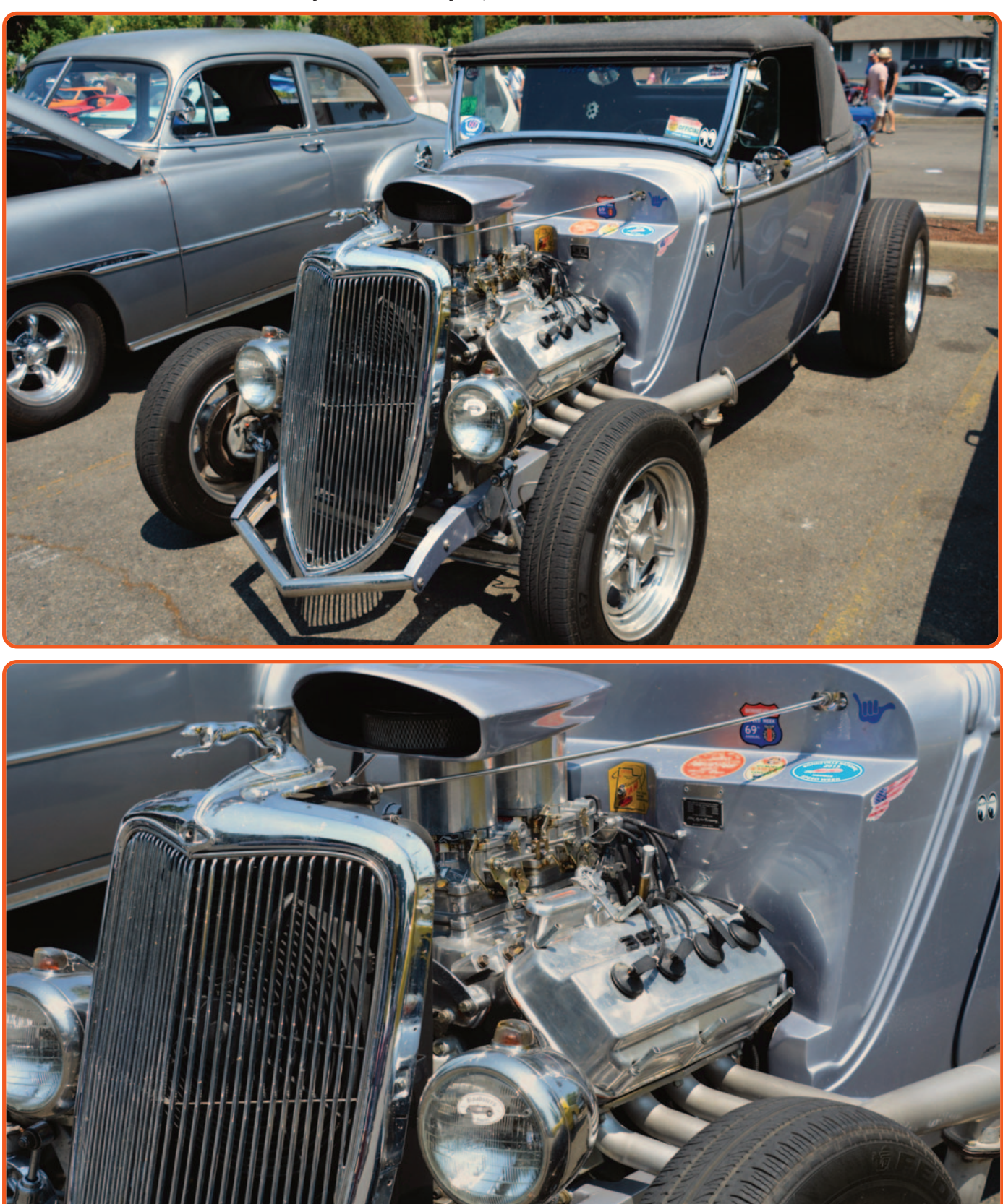
That thing got a Hemi? You bet! Badass 1934 Ford high boy street rod packed a serious punch with its pro built 1957 392 Hemi.

2024. Hope to see you there! Source Box Rogue Valley Classic Cruisers www.roguevalleyclassiccruisers.com Phone: 760-612-6365