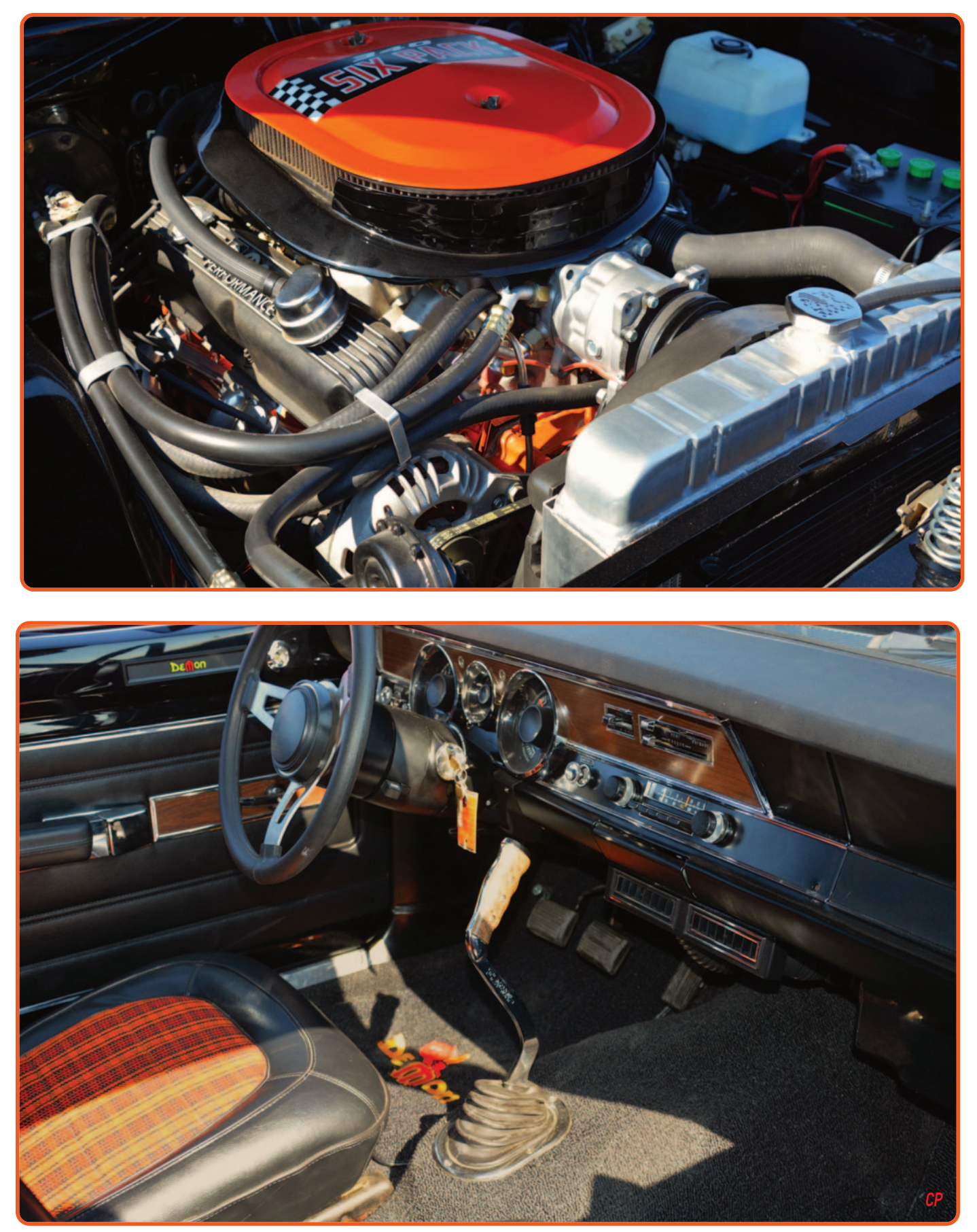
The winner of the coveted "Pick of the Park Award," was this stunning 1971 Dodge Demon 340. It was not only straight enough for mile deep black paint but featured a myriad of performance and handling upgrades. Taking a page out of Mr. Norm's playbook, the pro built 340 is equipped with a Six Pack induction system, while the interior features the obligatory Hurst Pistol Grip Shifter to stir the gears in the A833 4speed and the interior even featured original plaid seat inserts. Very cool!