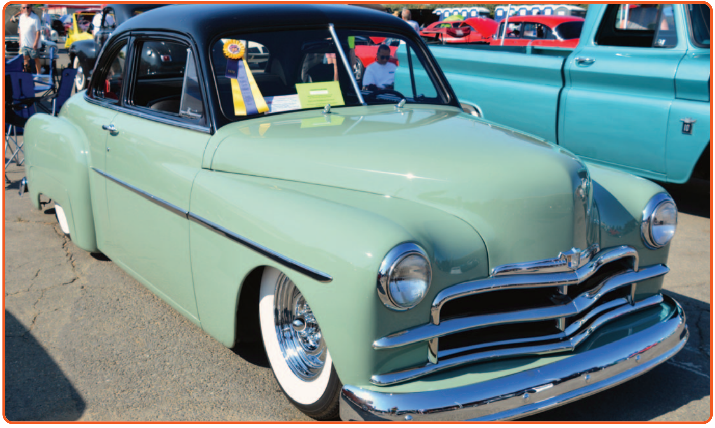
This 1950 Plymouth might be categorized as a mild custom, but the more you look at it, the more you'll find. It was very tastefully done, and loaded with custom mods that were so well integrated that it appeared as though they could have been done in the Plymouth design studio as a refresh for the 1949 model.