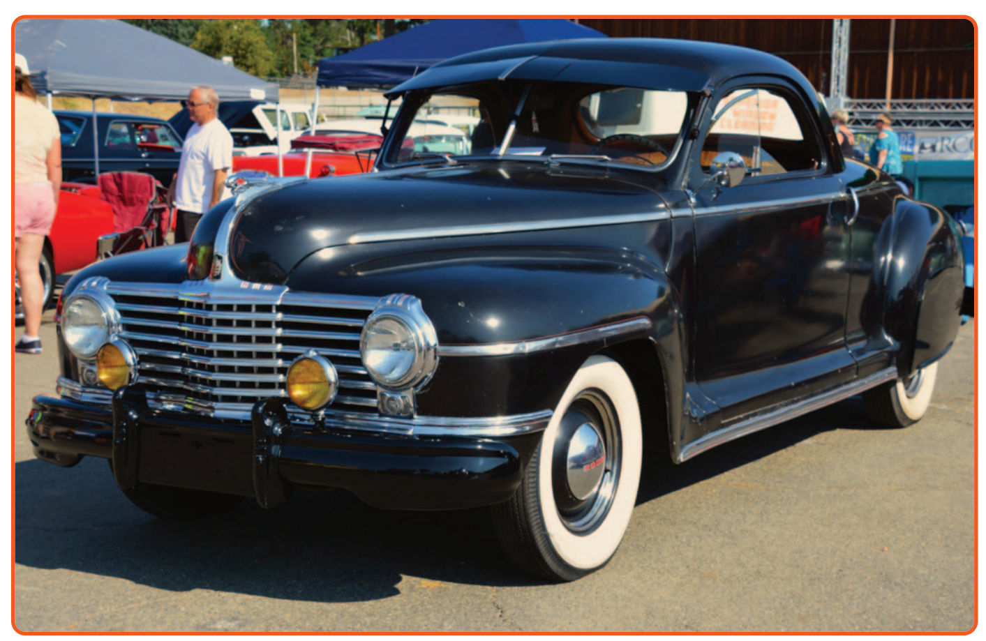
Rarer than the proverbial hen's teeth, this 1941 Dodge business coupe was the perfect example of an unrestored pre-war survivor.