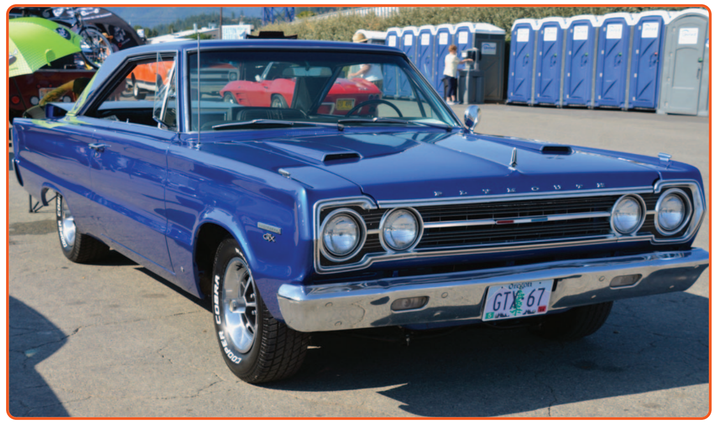
Nice original 1967 Plymouth GTX stood out in stark contrast to many of the over-the-top modified cars and trucks on display at the show. Equipped with nothing more than a set of Magnum 500s, it reminded us of what a new GTX looked like back in '67 when Plymouth was "Out to Win You Over."