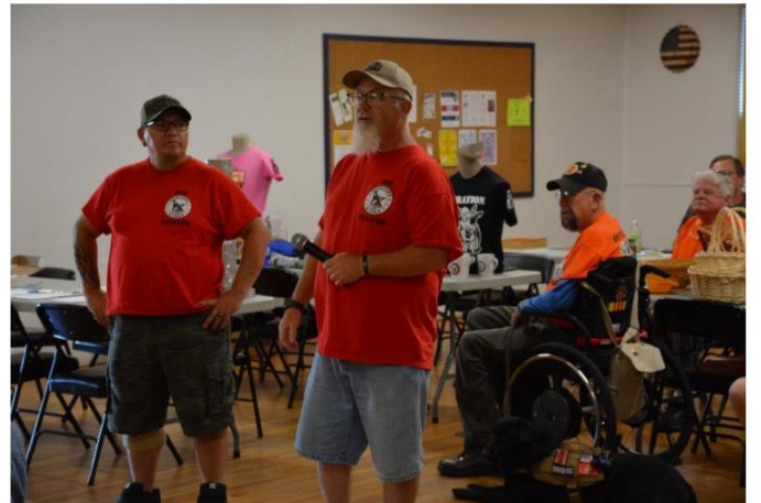
OPERATION RAMBO PRESENTATION