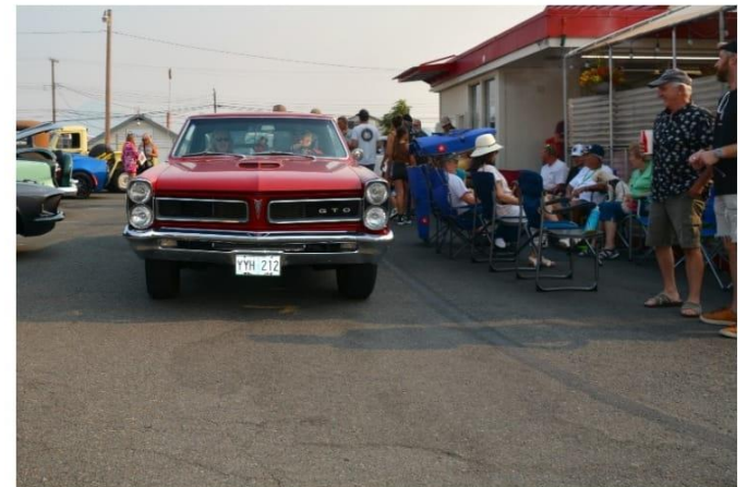
FABULOUS 50'S AMERICAN GRAFFITI CRUISE IN AT JIMMY'S CLASSIC DRIVE-IN